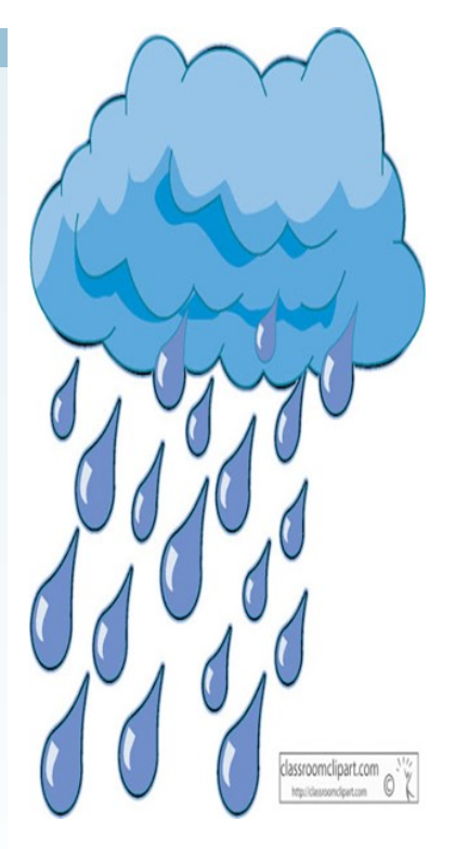
Even in the worst of storms: THIS TOO SHALL PASS!

http://4-h.org/wp-content/uploads/2019/04/4H-Healthy-Living-Activity-Guide.pdf